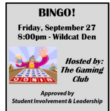
Approved Flyer Example